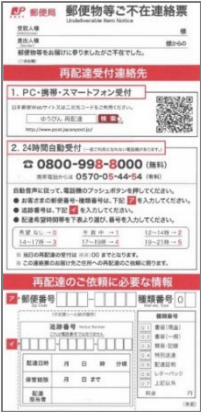
Example of “Undeliverable Item Notice” →

Please refer to the Japan Post website for more details about redelivery.